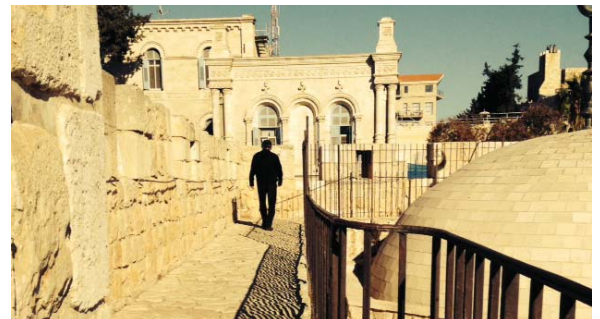
Jerusalem Ramparts Walk.