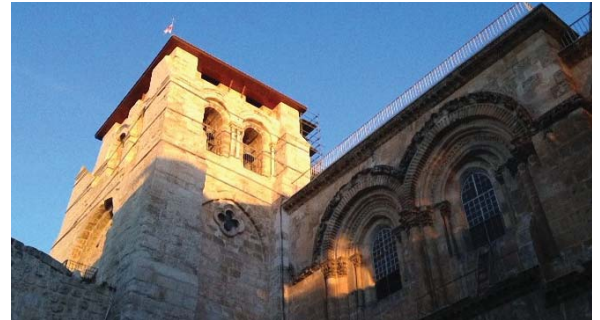
Church of the Holy Sepulchre.

Tour ends, transport to airport for those departing Israel.